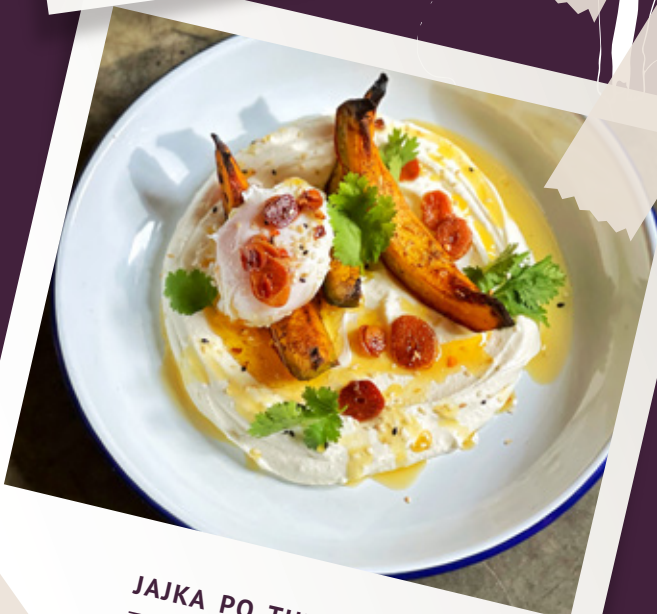
JAJKA PO TURECKU 29 TURKISH EGGS