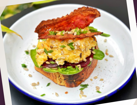
JAJECZNICA NA TOŚCIE 31 SCRAMBLED EGGS ON TOAST