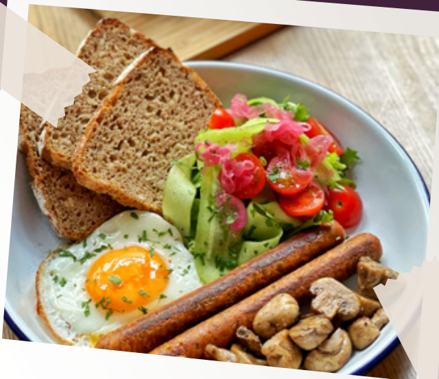
ŚNIADANIE KLASYCZNE 37 CLASSIC BREAKFAST