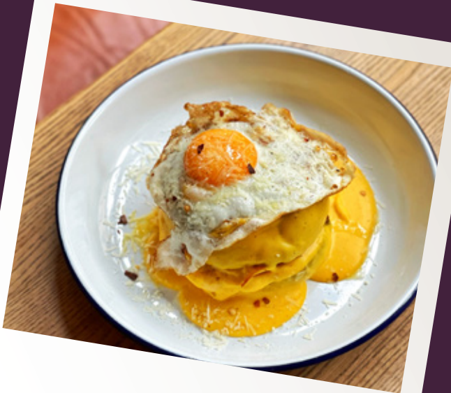
CROQUE MADAME 2.0 36